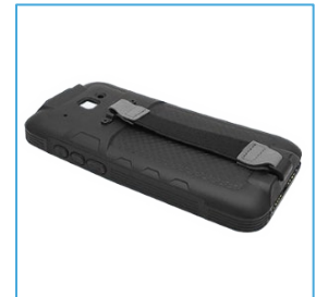
Rubber Boot with hand strap DC0509-BS