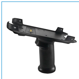
Pistol Grip DC0509-PG