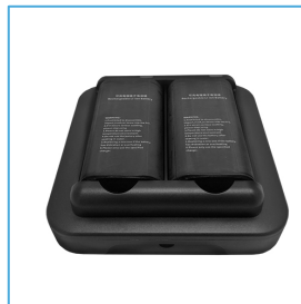
Pistol Grip Battery Charger DC0509-PG-CR