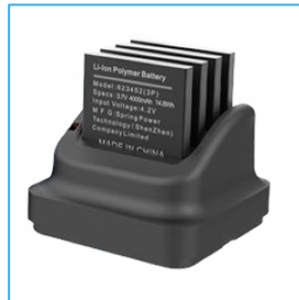
4 Slot Battery Charger DC0509-MC