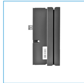
USB Magnetic Stripe Reader 3 Tracks PTE0105-MSR