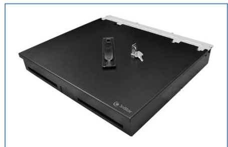
CT350 - Cash Tray for CD326 & CD350 CTC10 - Lockable Cash Tray Cover for CT350