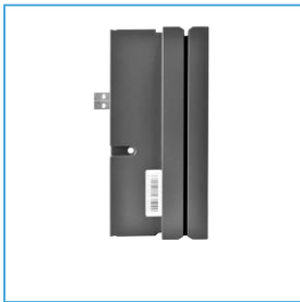
USB Magnetic Stripe Reader 3 Tracks PTA0156-MSR