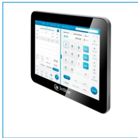
13" Customer LCD Display PTA0156-M13