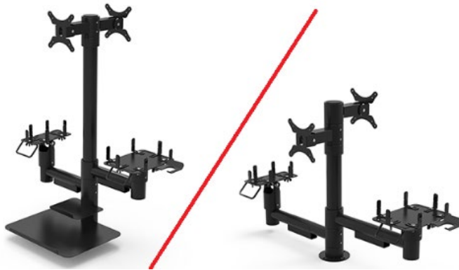
PSscreen-01 Screen Mount-Single Screen