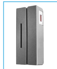
Card Reader and Fingerprint Reader