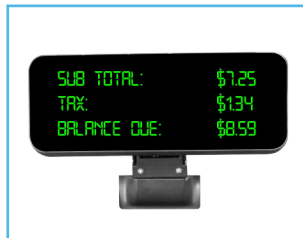
VFD 2*20 Customer Display